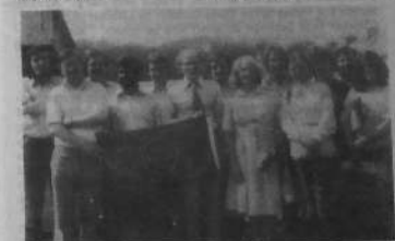
Delegates at Celtic League Council Meeting in Bala, Cymru.