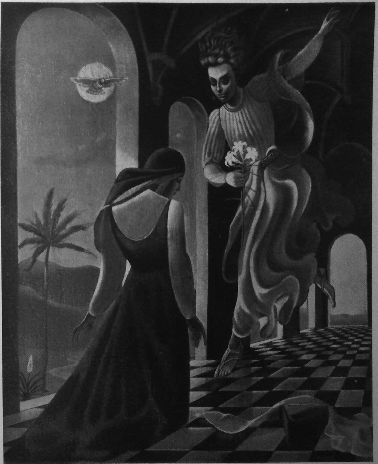
CECIL FRENCH SALKELD