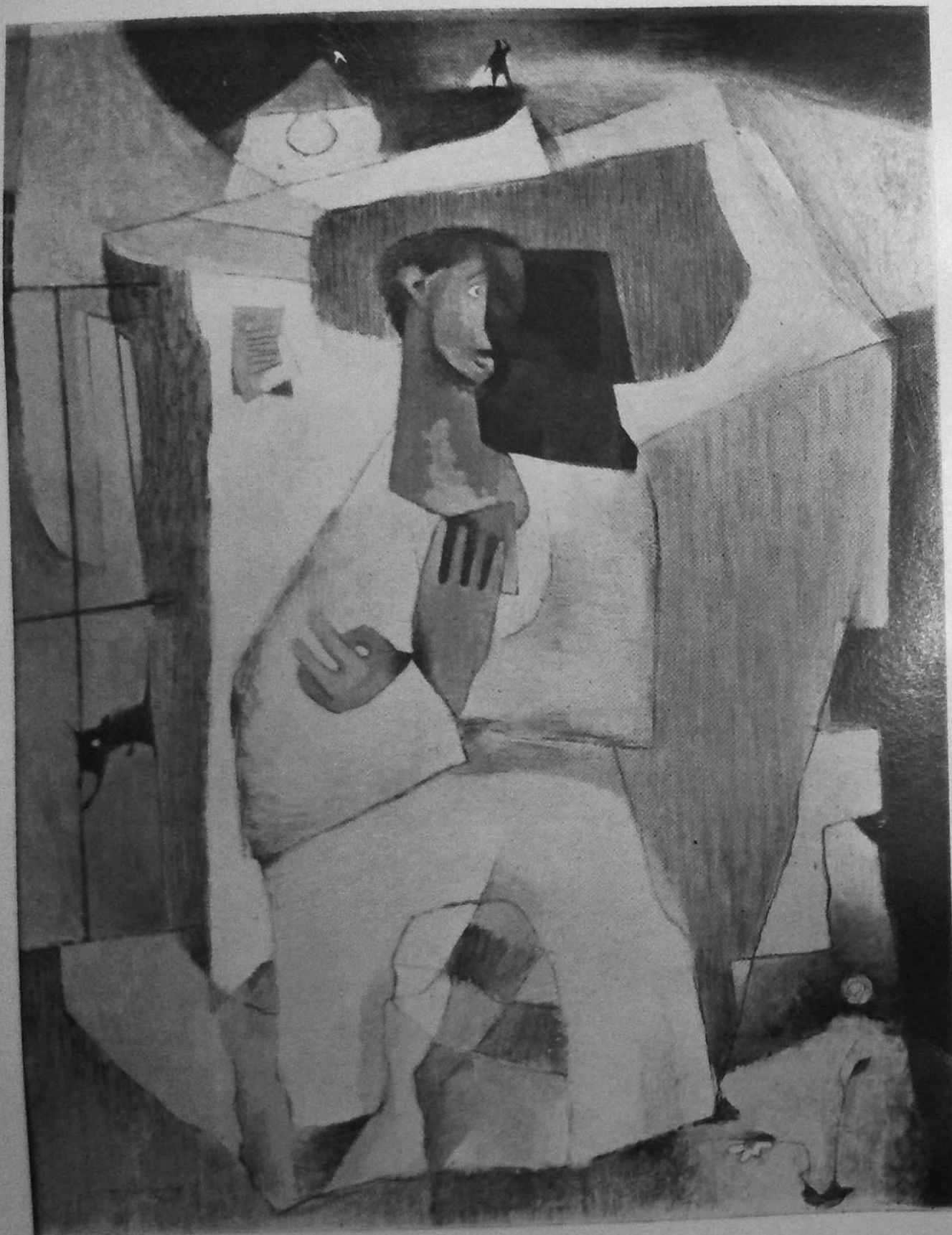
LOUIS LE BROCQUY