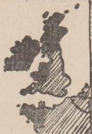
THE CELTIC COUNTRIES